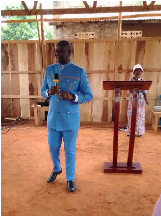
Figure 2: Bishop Robert Olupot Preaching in PAG Nakaloloke Worship CENTER Church